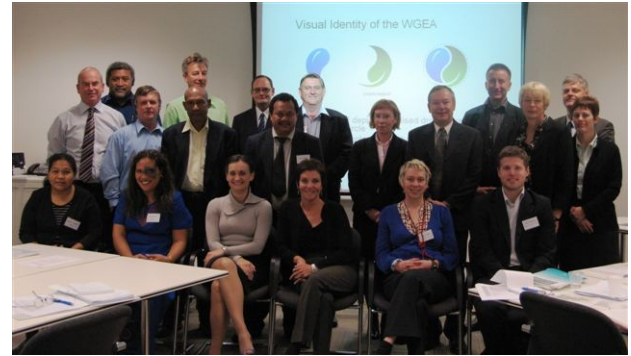
Delegates at the Fifth meeting of the ACAG/PASAI Regional Working Group on Environmental Auditing, Melbourne, Australia, April 2008

mitigation of greenhouse gas emissions. Participants at the RWGEA responded enthusiastically to adaptation as an area of focus in the coordinated audit, since the prospect of rising sea levels and more frequent extreme weather events makes adapting to the effects of climate change a critical issue for the Pacific region.