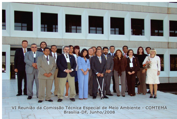
COMTEMA meeting participants at TCU main entrance

As the INTOSAI regional group representing the SAIs of Caribbean and Latin American nations, the Organization of Latin American and Caribbean Supreme Audit Institutions' (OLACEFS) stated objectives are to support scientific investigation; conduct training and promote specialization on topics of interest; and provide technical advice, assistance and coordination for the SAIs of Latin America and the Caribbean. OLACEFS's traditions date back to the 1960s, and it has existed under its current name since 1990.