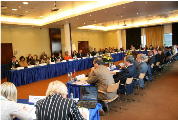
Representatives of the WGEA Steering Committee members met in Tallinn, Estonia, for its 7 th meeting since its formation in 2003

The last Steering Committee (SC) meeting was hosted by the National Audit Office of Estonia, in Tallinn on 6 to 9 May 2008. All project leaders in the 2008-2010 work period gave an overview of the status of their project. Project leaders of the guidance materials also presented preliminary tables of contents. The SC approved all work plans. In addition, five subject matter experts gave their presentations and input on the five guidance documents to be produced in this work period: climate change, sustainable development, forestry, fisheries, and minerals and mining.