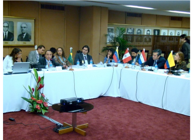
Group discussion among COMTEMA participants

The draft work plan approved by 6th meeting will be ratified by the members of COMTEMA at the next meeting, which is expected to be held in April of 2009. At that time, a new committee president will also be elected.